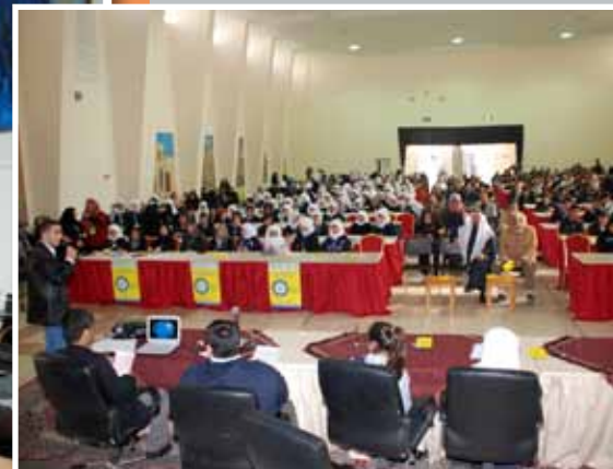
A YCC workshop in Copenhagen (left), and a conference in Kuwait (above)